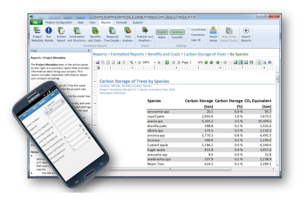
Learn i-Tree Eco desktop and mobile data collection

The US Forest Service and several key partners are offering an online training called the i-Tree Academy, designed to introduce the i-Tree suite of tools to a class of 45 participants from across the U.S. The Academy instruction will be delivered by experienced members of the i-Tree project team, focused on helping users learn key i-Tree applications which can be used to inventory, assess, and report on the value of urban forests and greenspace.